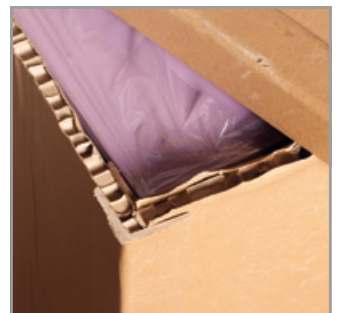
Heavy Duty Packaging